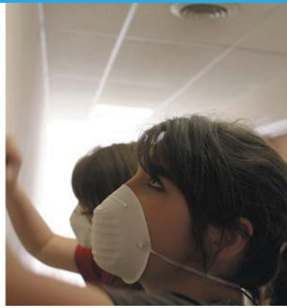
October Service Days at MVBC